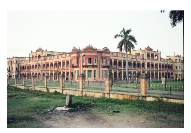
Banaras Hindu University

Your private tour includes Bharat Mata Temple with a big relief map of India in marble, Durga Temple, Tulsi Manas Temple, Banaras Hindu University which has an art Gallery and the Mosque of Mughal Emperor Aurangzeb built on a site of an ancient Hindu Temple. You will be transferred to Bodhgaya by private car (275km / 07hrs), hotel transfer, dinner included, overnight Bodhgaya.